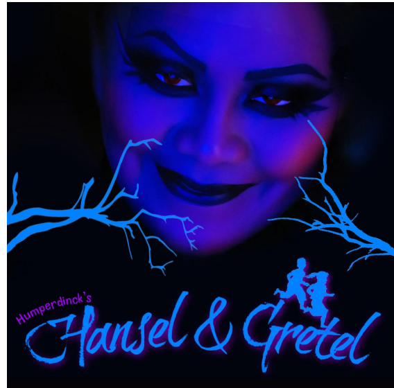
Hansel & Gretel May 11 & 12, 2024 Yost Theatre Santa Ana, CA