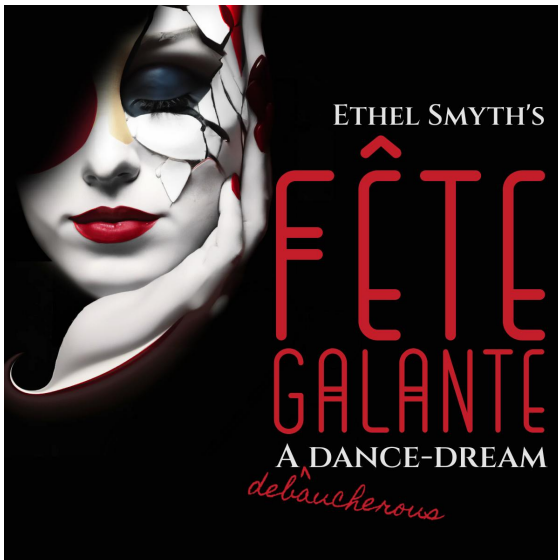
Smyth's Fête Galante March 8-10, 2024 Chance Theatre Anaheim, CA

Visit LyricOperaOC.org or call 949-854-4646